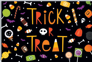
0650.82538 $3.75 Hope it's sweet! Emboss

FREE FREIGHT ON YOUR FIRST ORDER! Minimum order of $50