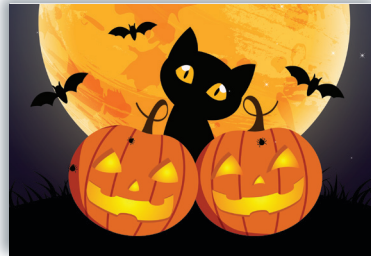
0650.82550 $3.75 Have a meow-velous Halloween! Foil