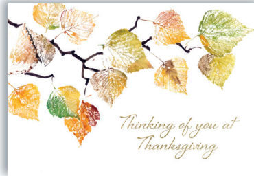
0660.82564 $3.75 Thinking of you at Thanksgiving ...and counting you among the blessings of the season. Foil