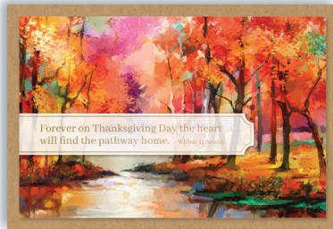
0660.82560 $3.95 Forever on Thanksgiving Day the heart will find the pathway home. Near or far, wherever we are, we are always together in our thoughts...and in our hearts. Happy Thanksgiving. Foil, Handmade