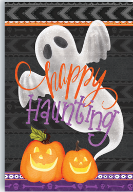
0650.82545 $3.75 It's time to scare up some fun! Foil, Emboss