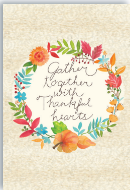
0660.82557 $3.75 Gather together with Thankful hearts Sending warmest wishes for a Happy Thanksgiving. Glitter, Emboss