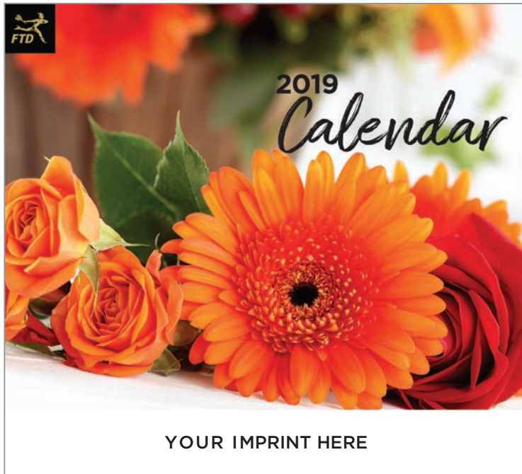
11"W x 10"H closed.

Custom Wall Calendars and Pocket Calendars