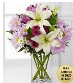
WGFK376 Lavender Fields-Vase Included $39.99 + shipping