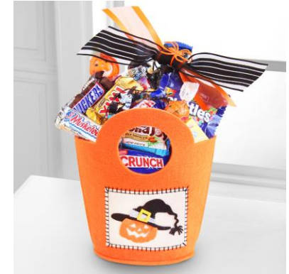
WGG314 Halloween Treats