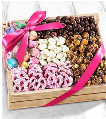
WGGF419 Mother's Day Sweets Gourmet Gift Basket