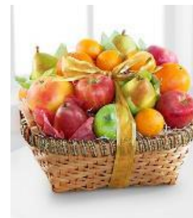
WGGF66 Kosher Fruit Basket $39.99 + shipping