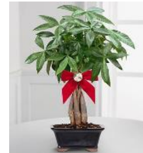
WGPB34 Peace & Prosperity Braided Money Tree $39.99 + shipping