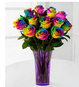
WGBD19 12 stems Rainbow Roses w/Vase $79.99 + shipping