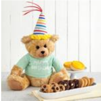
WGC532 Mrs. Fields® Happy Birthday Bear $34.99 + shipping