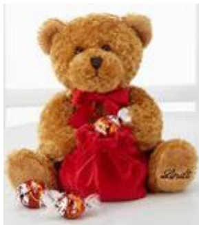
WGL117 Lindt Lovable Bear with Truffles – Good $19.99 + shipping