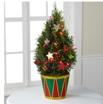
WGPT23 Christmas Mini-Tree