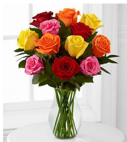
WGF492 12 stems Mixed Roses w/Vase $39.99 + shipping