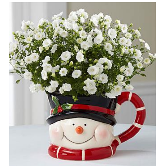
WGP896 Snowman Campanula