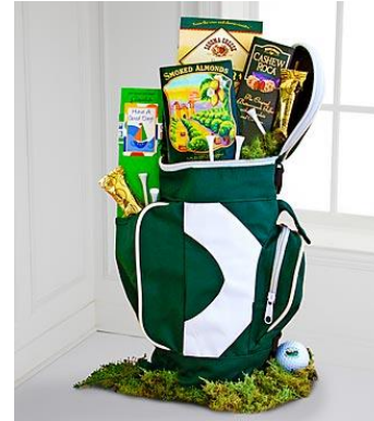
WGG719 Father's Day Caddy Snack