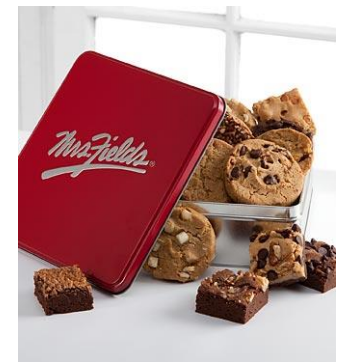
WGX950 Mrs. Fields® Classic Tin with Brownie and Cookie Assortment $34.99 + shipping