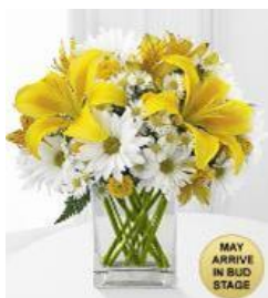
WGF187 Mixed Bouquet Vase Included $39.99 + shipping