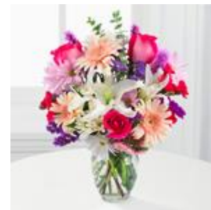
WGF103 Mixed Bouquet Vase Included $49.99 + shipping