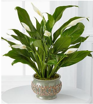
WGP409 Peace Lily Plant $39.99 + shipping