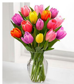
WGTULMIX 15 stems Mixed Tulips w/Vase $44.99 + shipping