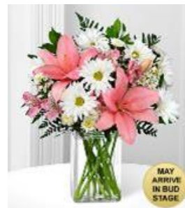
WGFH01 Mixed Bouquet Vase Included $39.99 + shipping