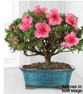
WGP119 Blooming Azalea Bonsai 8 inch $39.99 + shipping