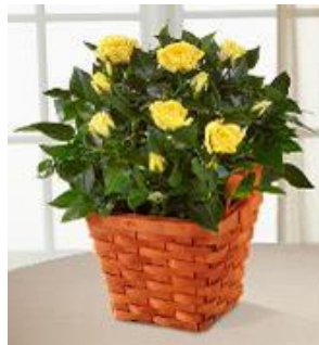
WGPS21 Lighthearted Moments Mini Rose Plant $24.99 + shipping