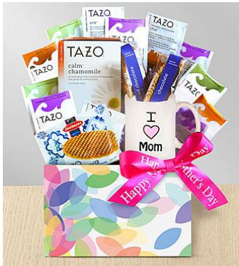
WGG947 Mother's Day Tea Basket