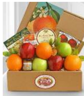
WGB525 Fruit and Cheese Box $39.99 + shipping