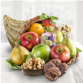
WGG398 Fall Fruit Basket