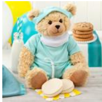
WGX946 Mrs. Field's Get Well Scrubs Bear $44.99 + shipping