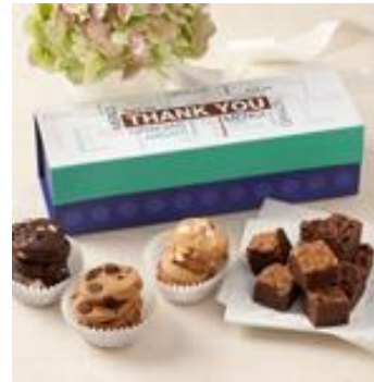
WGC543 Mrs. Fields® Thank You Mini Trunk – Good $24.99 + shipping