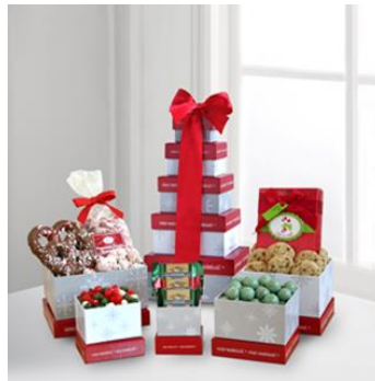
WGG406 Christmas Sweets Tower