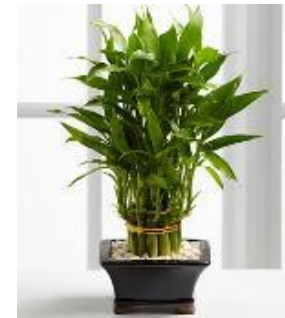
WGP120 Double Lucky Pyramid Bamboo $44.99 + shipping