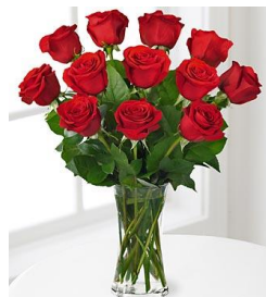
WGF416 12 stems Red Roses Vase Included $39.99 + shipping