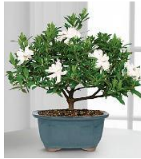
WGPB41 Blossoming Abundance Gardenia Bonsai - 6" $49.99 + shipping