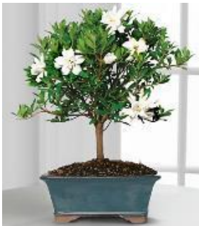
WGPB11 Blossoming Abundance Gardenia Bonsai - 8 $64.99 + shipping