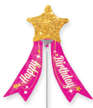
79126 14" HBD MAGICAL STAR $3.08 - INFLATED

To Order: MAYFLOWERDISTRIBUTING.COM TEL: 800.678.4892 | FAX: 888.655.0921 Visit our website to download our Spring/Summer Catalog for additional balloons!