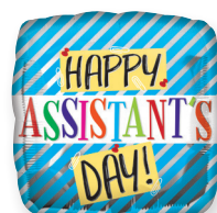
90271 17" HX® ASSISTANT DAY BLUE $1.11 - FLAT