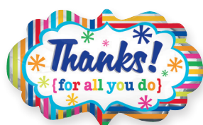
54742 27" STRIPED THANKS MARQUEE $3.27 - FLAT