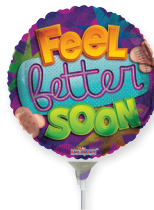
96517 9" FEEL BETTER SOON $1.69 - INFLATED