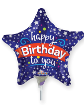
97050 4" HBD TO YOU STAR $1.13 - INFLATED