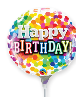
95529 9" HBD RAINBOW CONFETTI $1.76 - INFLATED