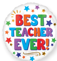
95897 17" HX® BEST TEACHER EVER $1.11 - FLAT