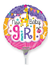
96529 4" BABY GIRL JUNGLE $1.13 - INFLATED