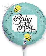
75397 9" BABY BOY BEE $1.75 - INFLATED