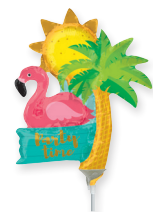
90282 14" LETS FLAMINGLE PARTY $3.08 - INFLATED