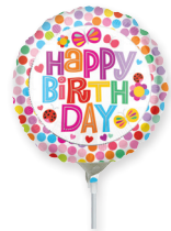
75383 9" HBD FLOWER $1.76 - INFLATED