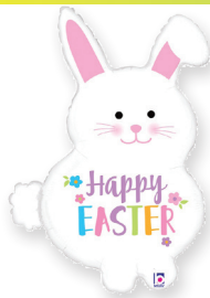
89369 32" HAPPY EASTER BUNNY $3.41 - FLAT

To Order: MAYFLOWERDISTRIBUTING.COM TEL: 800.678.4892 | FAX: 888.655.0921 Visit our website to download our Spring/Summer Catalog for additional balloons!