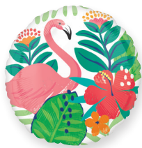
96023 17" HX® TROPICAL JUNGLE $1.11 - FLAT