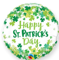
93318 18" ST PAT'S SHAMROCK $1.11 - FLAT