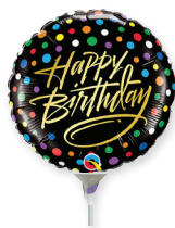
95537 9" HAVE A MAGICAL DAY $1.76 - INFLATED