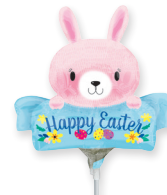
93638 14" PINK EASTER BUNNY $3.08 - INFLATED