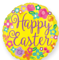
84751 17" HX® FLORAL HAPPY EASTER $1.11 - FLAT