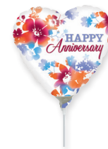
76142 4" ANNIVERSARY WATERCOLOR $1.18 - INFLATED