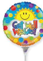
96519 9" GET WELL SUNSHINE $1.69 - INFLATED