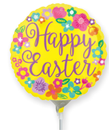
84761 4" FLORAL HAPPY EASTER $1.18 - INFLATED