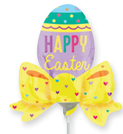
93640 14" EASTER EGG W/BOW $3.08 - FLAT