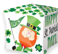
82904 15" CUBEZ™ ST PAT'S POT OF GOLD $2.81 - PKG