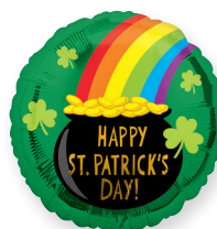
93630 17" HX® ST PAT'S POT OF GOLD $1.11 - FLAT