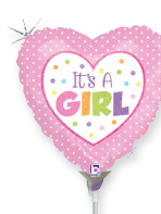
75405 9" BABY GIRL DOTS $1.75 - INFLATED