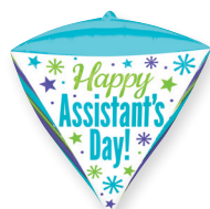
84770 17" DIAMONDZ™ ASSISTANT'S STRIPES $2.81 - PKG