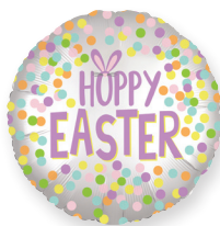
93635 18" SATIN LUXE™ EASTER $1.11 - FLAT