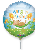
96521 4" GET WELL - HANG IN THERE $1.13 - INFLATED