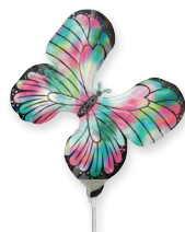
95716 14" IRIDESCENT T/P BUTTERFLY $3.08 - INFLATED