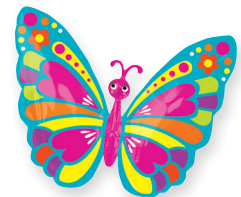
77327 26" SPRING BUTTERFLY $1.40 - FLAT