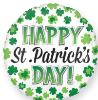
82902 17" HX® ST PATRICK'S DAY $1.11 - FLAT