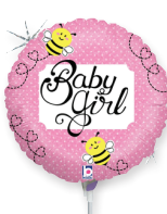
75401 9" BABY GIRL BEE $1.75 - INFLATED