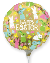
90262 9" HAPPY EASTER GOLD $1.76 - INFLATED