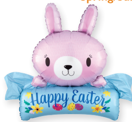
90267 32" PINK EASTER BUNNY $3.27 - FLAT