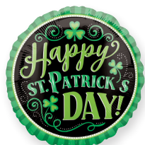
89662 17" HX® CLOVER ME LUCKY $1.11 - FLAT