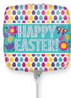
90264 9" EASTER EGG PATTERN $1.76 - INFLATED