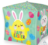
90270 15" CUBEZ™ BUSY BUNNIES $2.81 - PKG