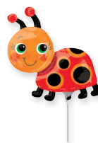
90286 14" MISS LADYBUG $3.08 - INFLATED