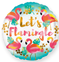
90277 17" HX® LETS FLAMINGLE $1.11 - FLAT