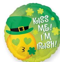
89346 17" HX® KISS ME EMOTICON $1.11 - FLAT