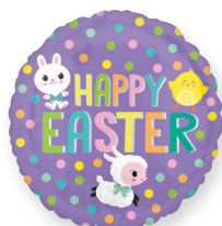
93634 17" HX® EASTER FUN $1.11 - FLAT