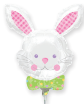
84755 14" HAPPY HOP BUNNY $3.08 - INFLATED