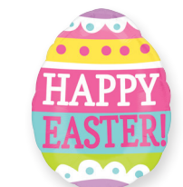
90255 16" JR. SHAPE SPRINGY EASTER EGG $1.40 - FLAT