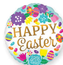
93633 17" HX® HAPPY EASTER $1.11 - FLAT