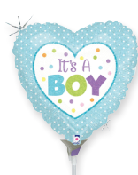
75409 9" BABY BOY DOTS $1.75 - INFLATED