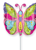
31710 14" GARDEN BUTTERFLY $3.08 - INFLATED