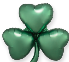
93632 29" SATIN LUXE™ EMERALD SHAMROCK $2.78 - FLAT