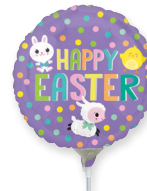
93646 4" EASTER FUN $1.18 - INFLATED