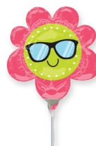
84778 14" FUN IN SUN FLOWER $3.08 - INFLATED