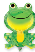
90284 14" MR FROGGY - INFLATED $3.08 - INFLATED