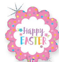
89367 18" EASTER FLOWER HOLO $1.12 - FLAT