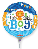
96527 4" BABY BOY JUNGLE $1.13 - INFLATED