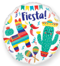
95746 17" HX® FIESTA PARTY $1.11 - FLAT