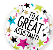
90272 17" HX® GREAT ASSISTANT STARS $1.11 - FLAT