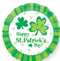
46509 18" LUCKY WISHES $0.58 - FLAT

To Order: MAYFLOWERDISTRIBUTING.COM TEL: 800.678.4892 | FAX: 888.655.0921 Visit our website to download our Spring/Summer Catalog for additional balloons!