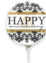
74795 9" HAPPY ANNIVERSARY $1.76 - INFLATED