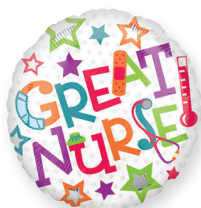
50866 17" HX® GREAT NURSE $1.11 - FLAT