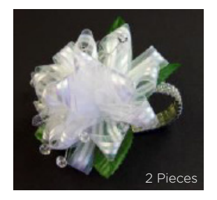
WHITE/IRIDESCENT Clear Gem Wristlet

Call FTD® Marketplace™ at 800.767.4000 to place your order.