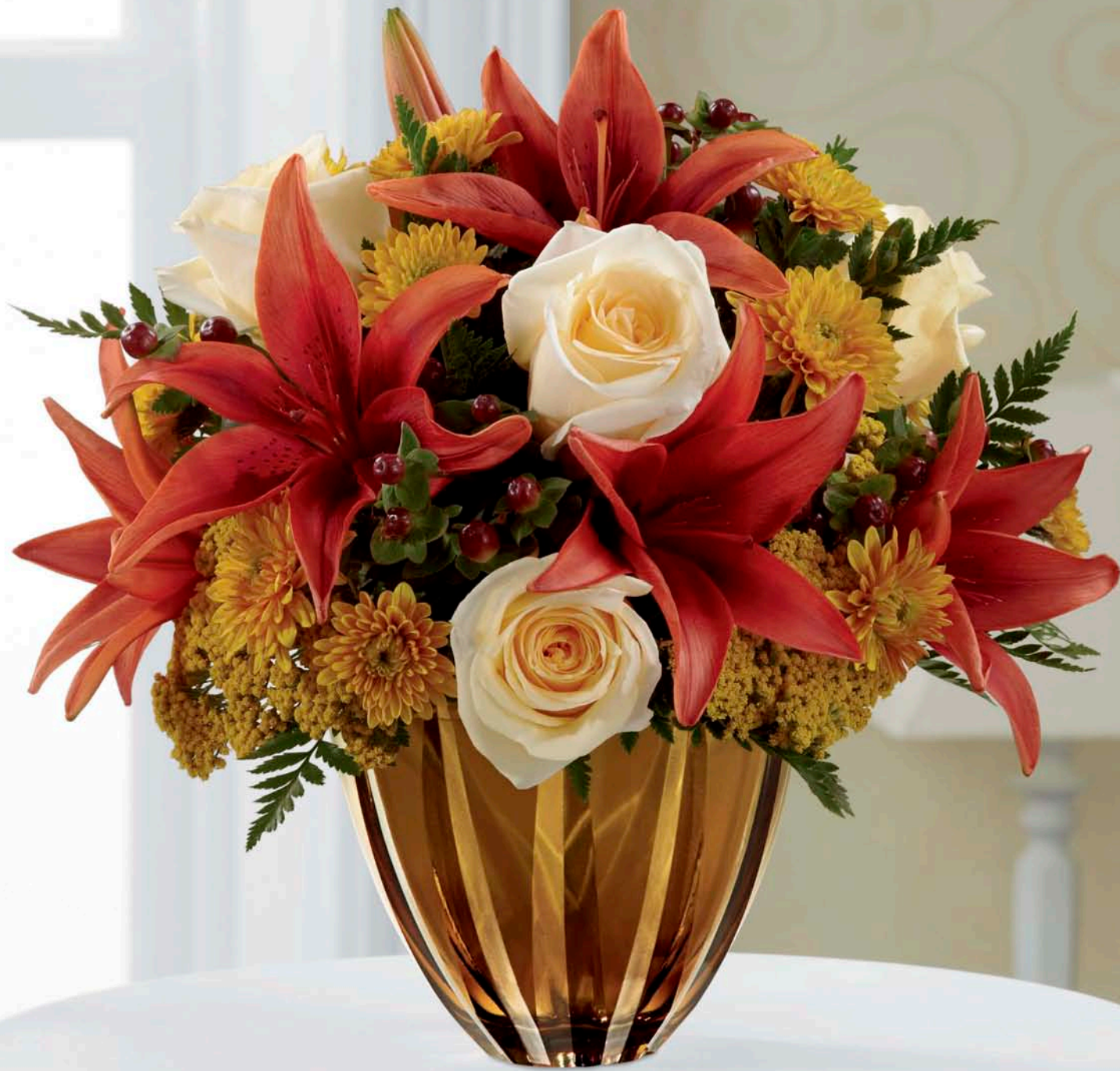
The FTD® Giving Thanks™ Bouquet - F4

A vase of sunset amber glass is created with deep-faceted cuts that give a subtle, elegant effect. No wonder this bouquet of roses, lilies and cushion poms in the season's most vibrant hues is destined to become a favorite for Thanksgiving decorating and gifting.