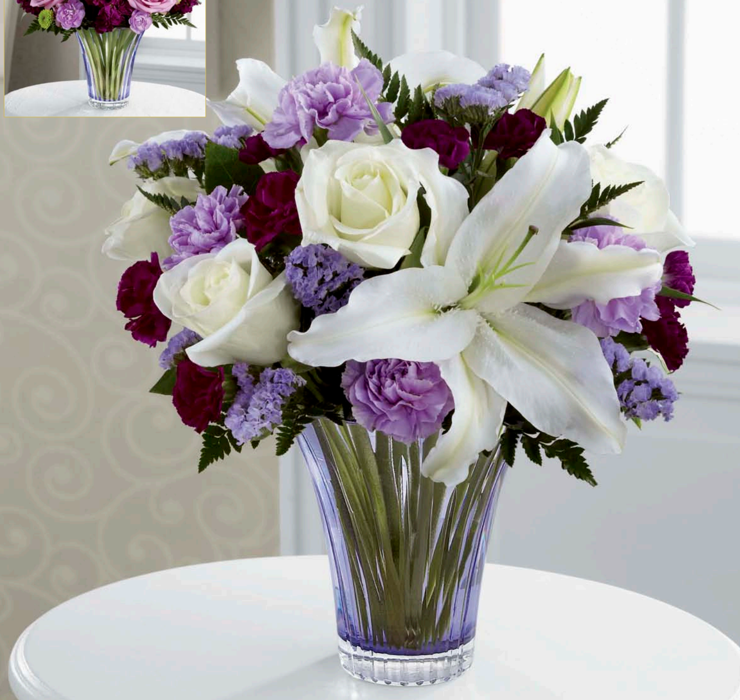
The FTD® Thinking of You™ Bouquet - TOY The FTD® Timeless Traditions™ Bouquet - TML

This lavender glass vase featuring hand-cut accents is crafted to perfection. Both mixed flower bouquets are exceptional for celebrating everyday occasions like birthdays, graduations and anniversaries, and expressing get well and thank you.