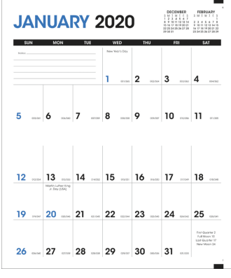
Dimensions: 3 1/2"W x 6"H closed. 7"W x 6"H open.