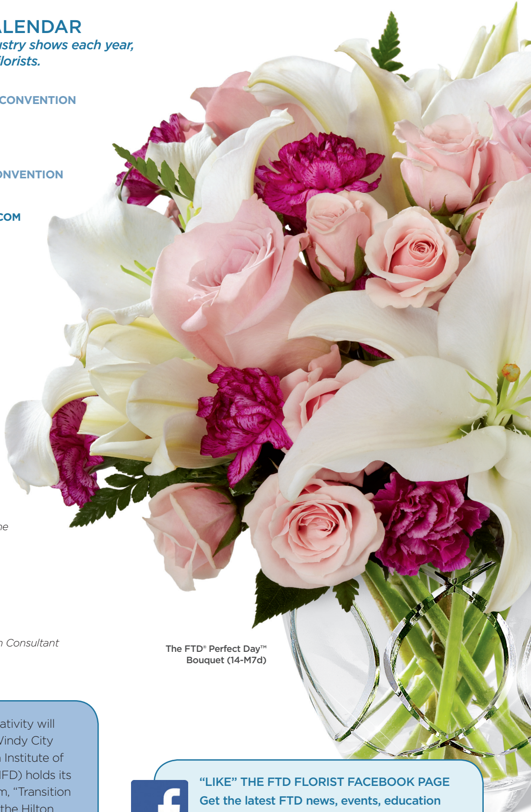
The FTD® Perfect Day™ Bouquet (14-M7d)